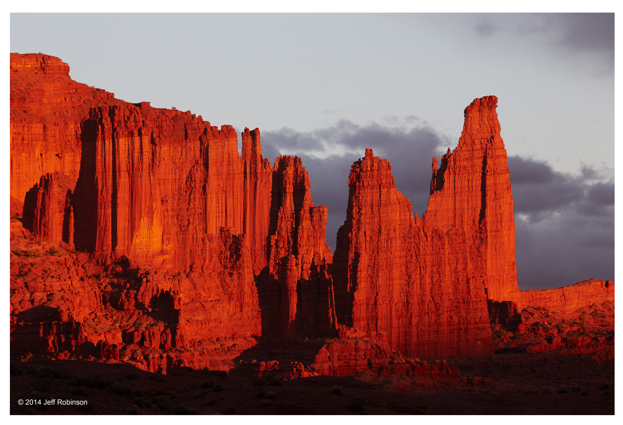
Utah is known for the deep red color of its rocks at sunset, and the Fisher Towers are an excellent example of this. (10/12/2014, Utah Highway 128 east of Moab, UT)