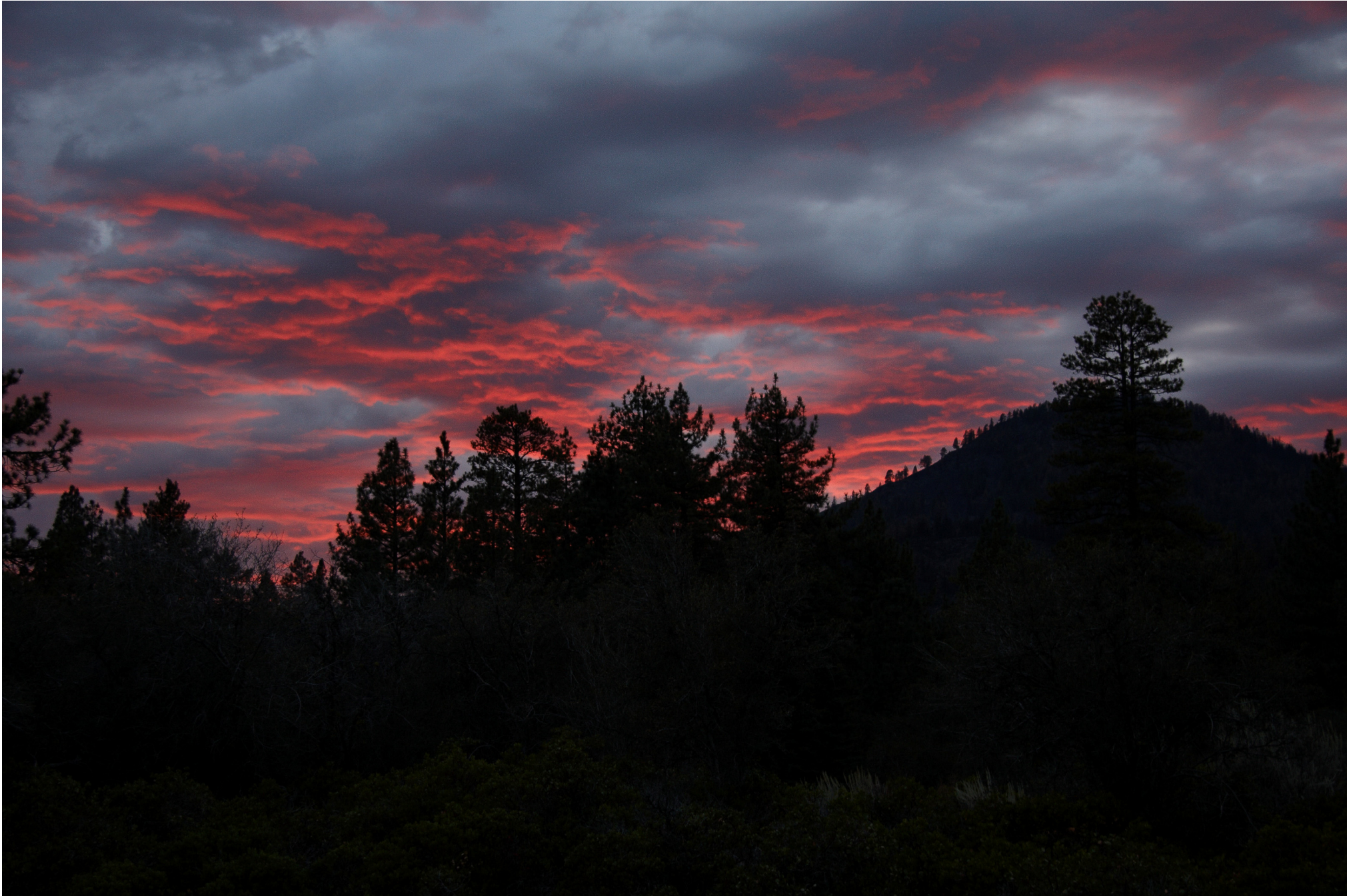
Sunset over Sugarloaf Peak 9/12/2009, Trail to Subway Cave, Lassen National Forest