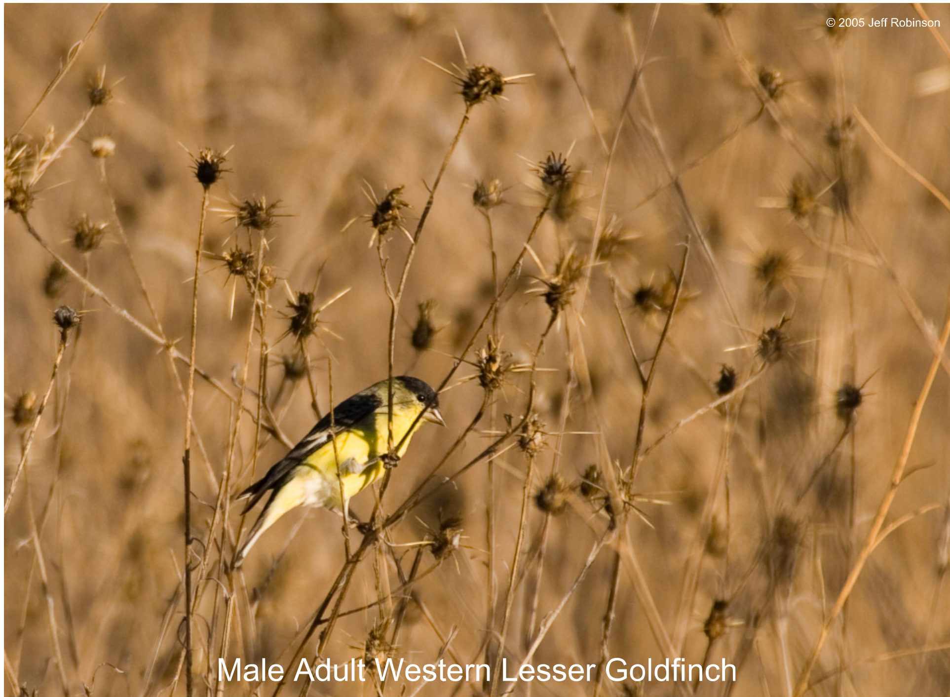
Male Adult Western Lesser Goldfinch