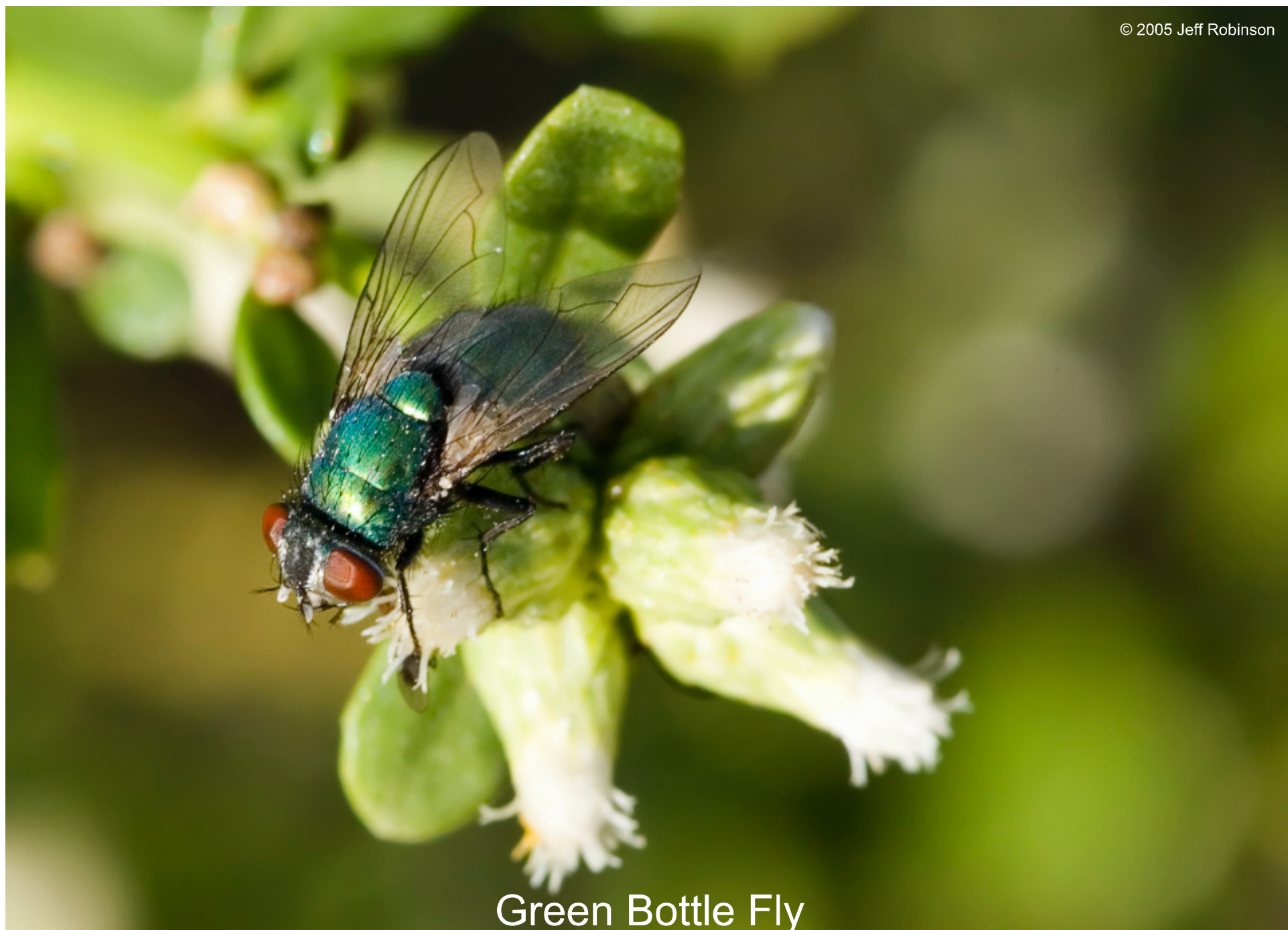
Green Bottle Fly