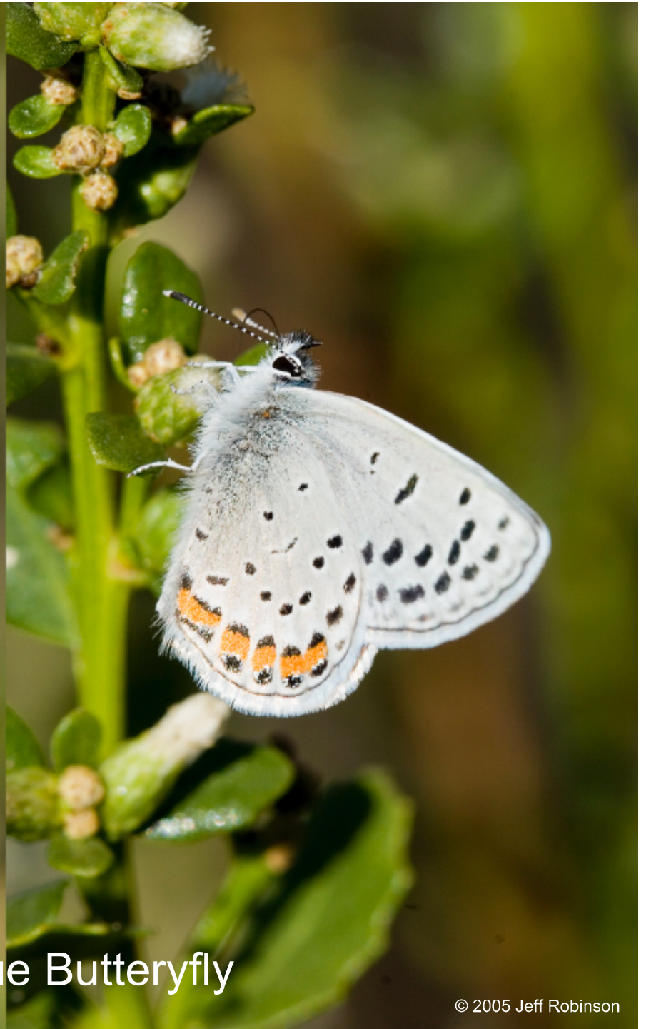
Acmon Blue Butterfly