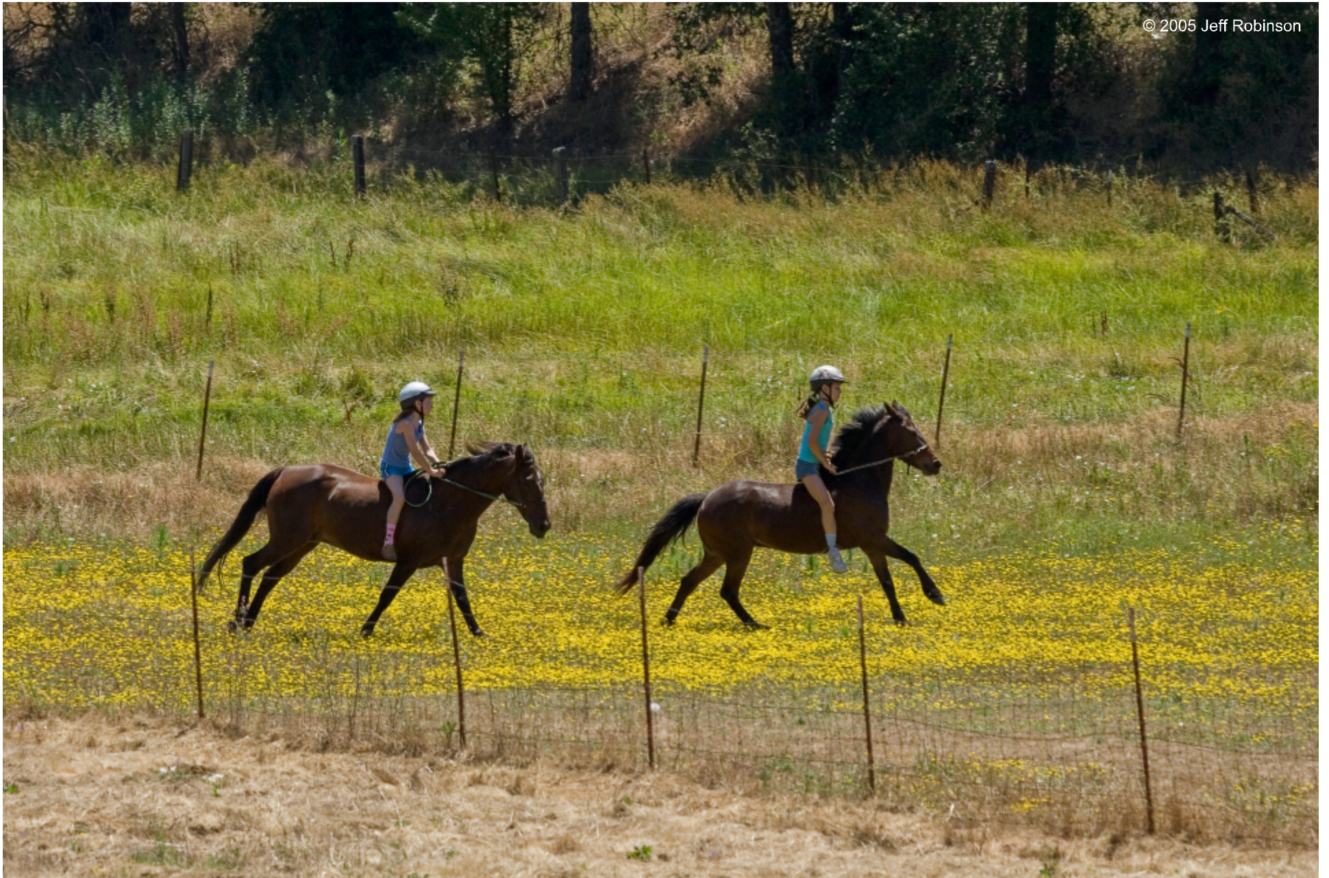
Horses in Field