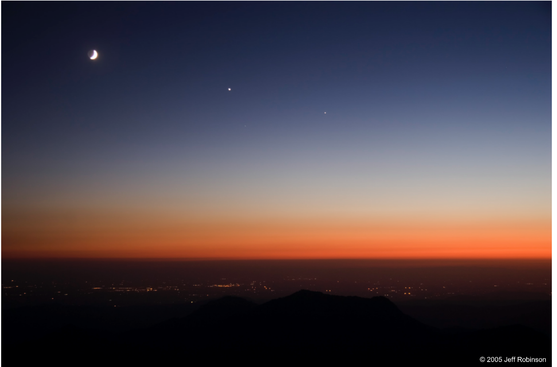
Sunset from Moro Rock